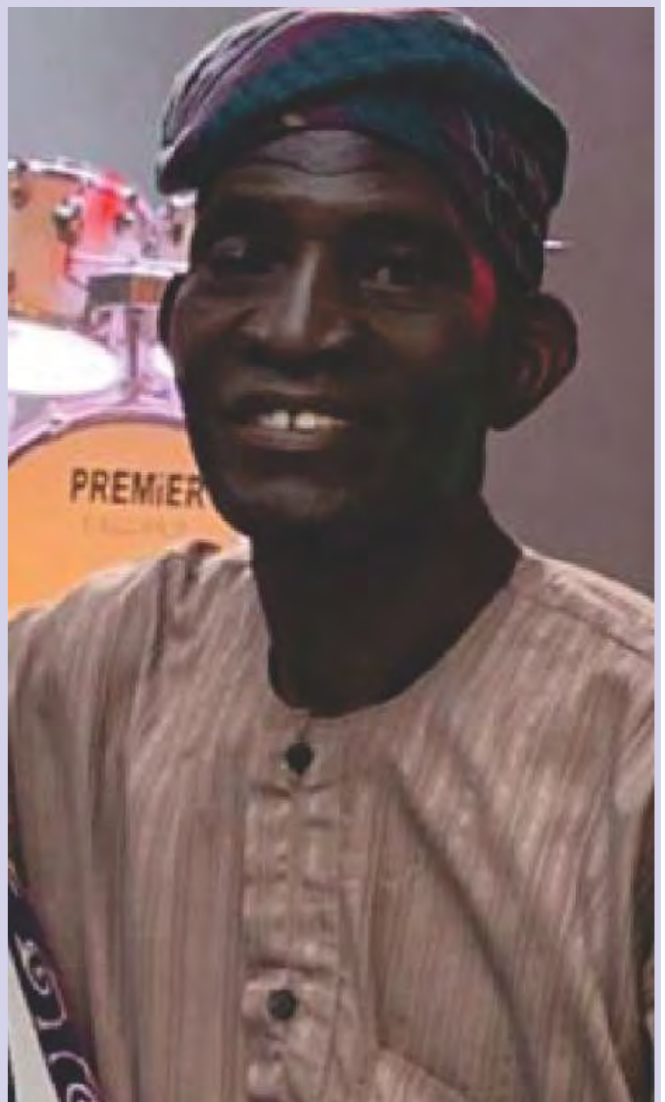
Prince Eji Oyewole

His band Afrobars Band is still very active today and they play Jazz, Highlife, etc Prince Eji Oyewole who is a double Prince is a native of Ibadan in Oyo State.